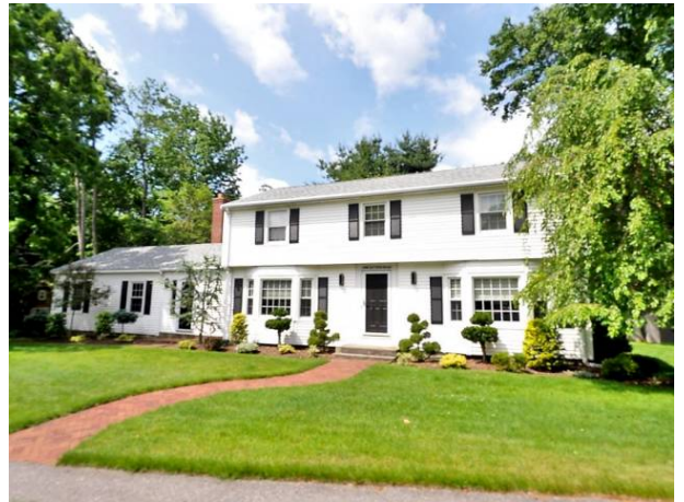
( http://images.vgsi.com/photos/WorcesterMAPhotos/\00\06\12\55-017-00225.jpg )