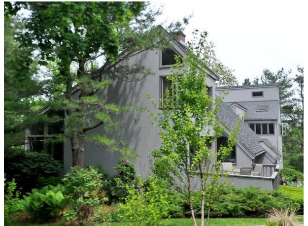
( http://images.vgsi.com/photos/WorcesterMAPhotos/\00\03\12\21-018-0021A.jpg )