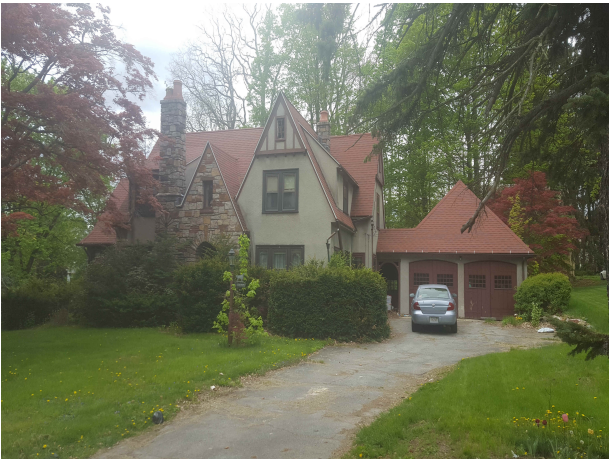
( http://images.vgsi.com/photos2/WorcesterMAPotos//\00\10\22\90.jpg )