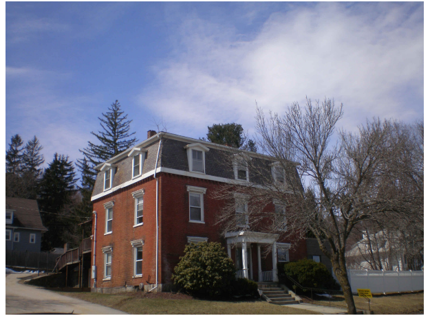
( https://images.vgsi.com/photos2/WorcesterMAPhotos//\00\10\11\11.jpg )